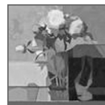
Peonies 2014 oil on linen on panel 8" x 8"